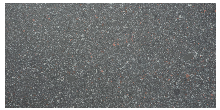
Dark Grey (LOOEDG)